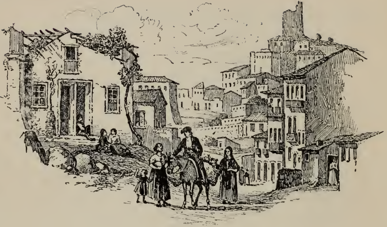
STREET IN MESSINA